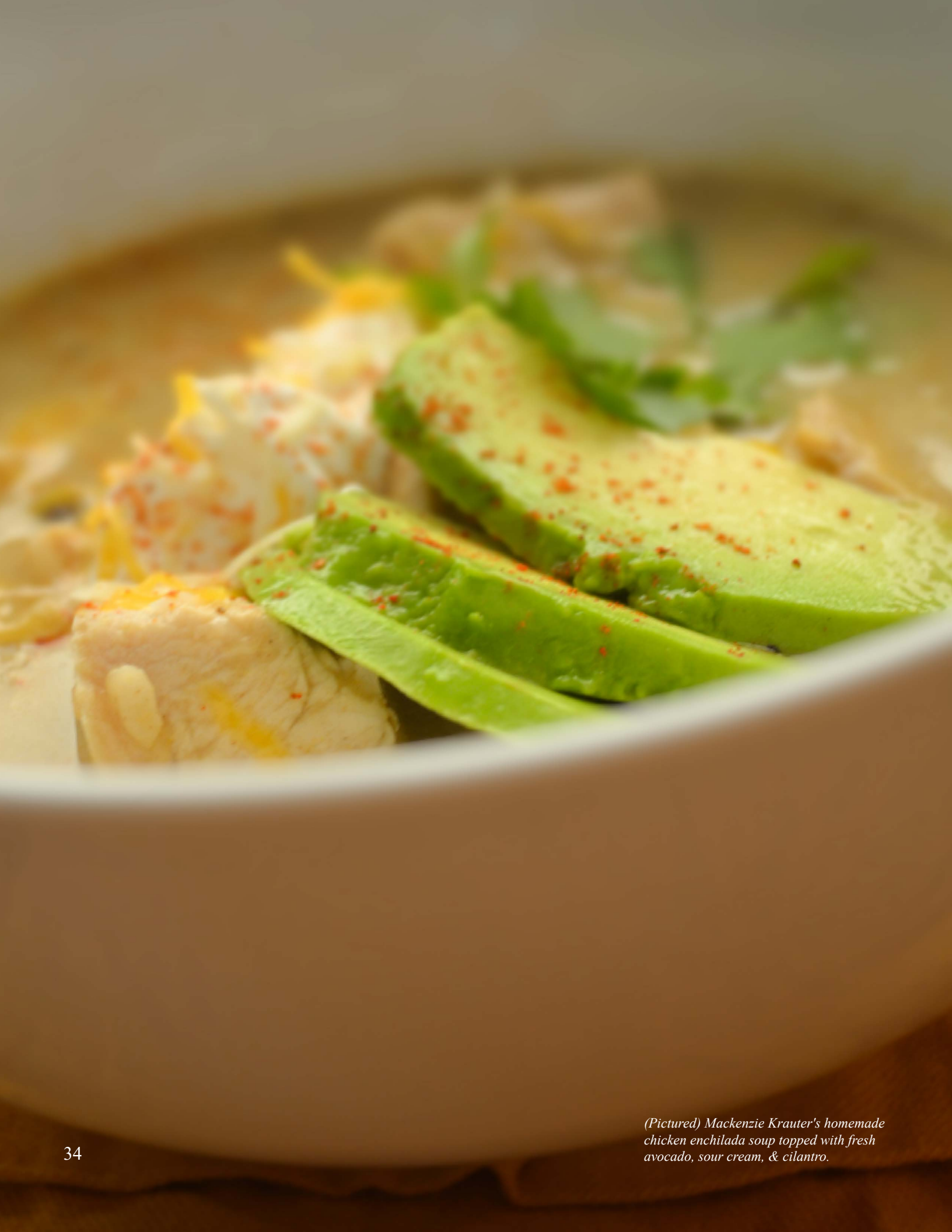
(Pictured) Mackenzie Krauter's homemade chicken enchilada soup topped with fresh avocado, sour cream, & cilantro.